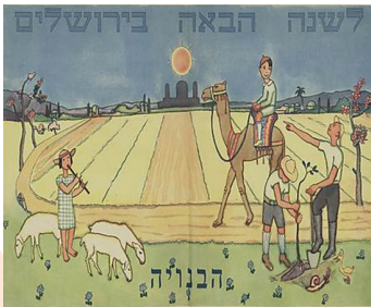
1 / Israel, 1943 Jerusalem with stone buildings in the background, and plowed fields in the center.

For thousands of years, all around the world, Jewish people celebrated Pesach, read the Haggadah, and finished with the words, "Next Year in Jerusalem!" In every country and period different Haggadot were written that told a special story. Take a look at the pictures of Jerusalem in front of you that are taken from different Haggadot and answer the following questions: