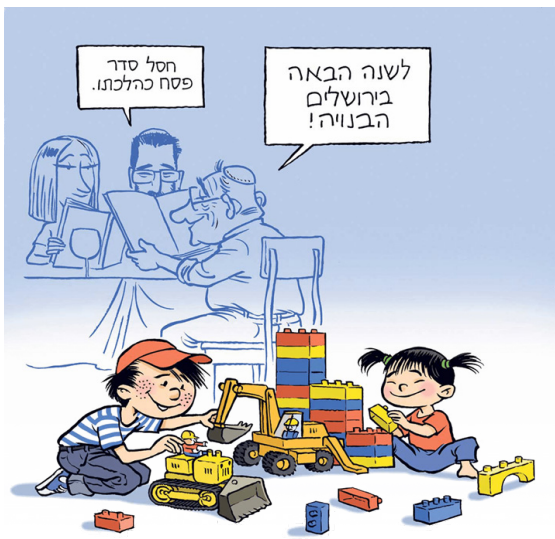
An online Haggadah by the Yedioth Ahronoth newspaper, illustrated by Michel Kishka, 2021.

1 / Who is building Jerusalem, according to the picture?