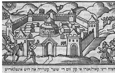
2 / Venice Haggadah, Italy, 1609 Jerusalem in an end-of-days vision according to the book of Isaiah. The Messiah rides on a donkey and the prophet Elijah holds a Shofar and announces the Messiah's arrival. They are surrounded by people who have made a long journey.