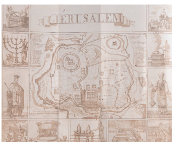
5 / Bordeaux Haggadah, France, 1813 A map of Jerusalem and its surroundings. Temple utensils and the High Priest.